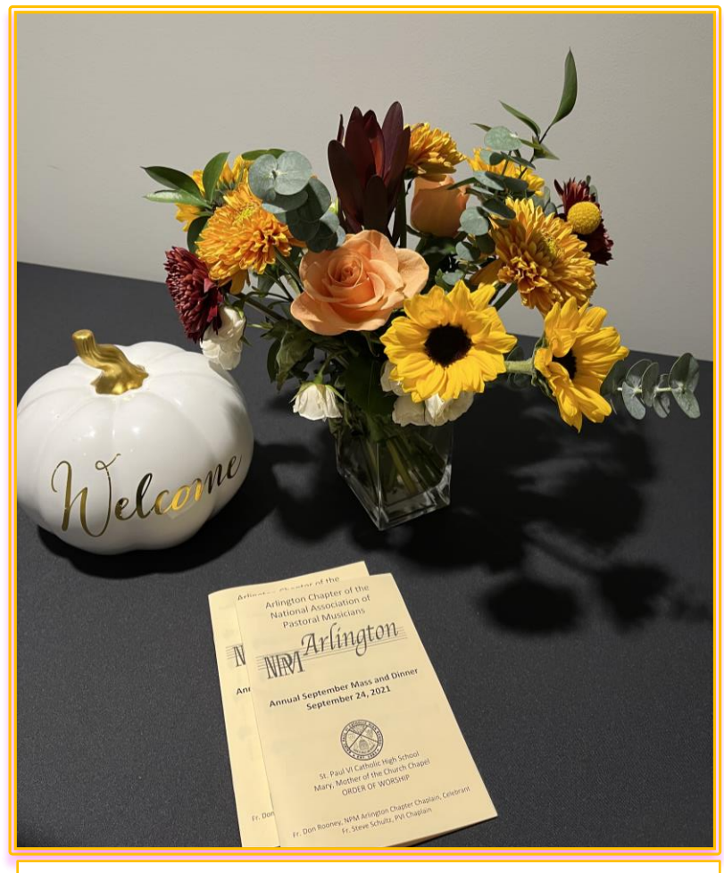
A display from the recent NPM Arlington Mass/Dinner. See more on page 7.