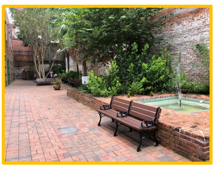
Courtyard at the Jean Lafitte National Historic Park and Preserve Visitor Center. New Orleans, LA

At that time, I prayed virus would only be then for a few months, nineteen months later pandemic which our music ministries of the pandemic has become find. Indeed, the reality as the noise of relentless and trying to navigate new school and continued to get back to a exhausting both psychologically.